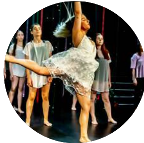
Melton Campus Part of the SMB College Group