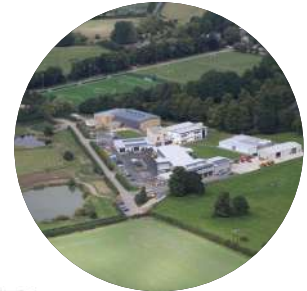
Brooksby Campus Part of the SMB College Group

SMB College Group continues to invest in dedicated new college routes, making it even easier to access the course of your choice. SMB College Group is accessible from all parts of Leicestershire and surrounding counties. Alongside our direct routes into college, you will also find an excellent network of public bus services into our campuses. Our direct routes are now available to all SMB College Group students including degree level. You will have to apply for a new travel pass for each year of your chosen course. All annual passes cost £750 payable in full or in instalments by direct debit.